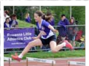
RLAC Season 2012-13